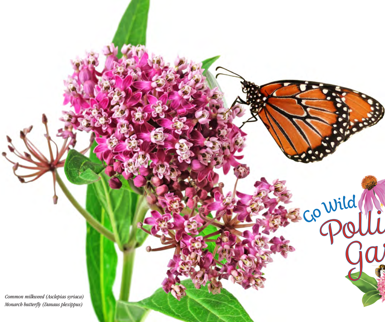
Common milkweed (Asclepias syriaca) Monarch butterfly (Danaus plexippus)